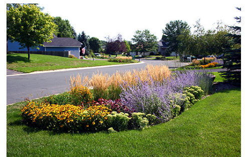
This rain garden catches runoff from the yard and prevents the polluted water from flowing into the storm drains.

Rain gardens are becoming more popular as homeowners and businesses seek ways to live more ecologically. Bachman's Wholesale Nursery has added 100 additional rain garden hardy plants this year alone! Some cities are even offering rebates and other incentives for homeowners who install a rain garden. Check with your local city hall then call us to show you how you can incorporate a rain garden into your landscape.