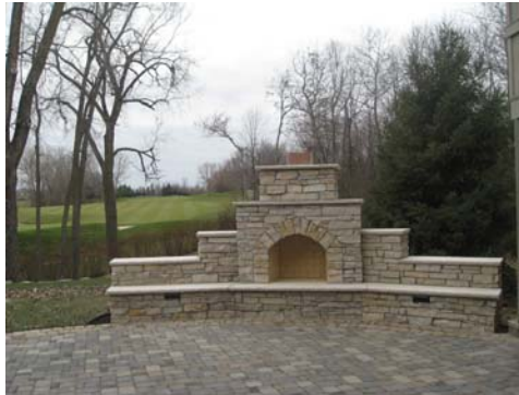
This customized fireplace was finished just as the snow began to fly last fall. Imagine the fun to be had this summer in this beautiful outdoor living room!

fire can only be seen from the opening in one side of the pot. But portable Chimineas are smaller and simpler, and run a smaller price tag—from less than $100 to several hundred dollars.